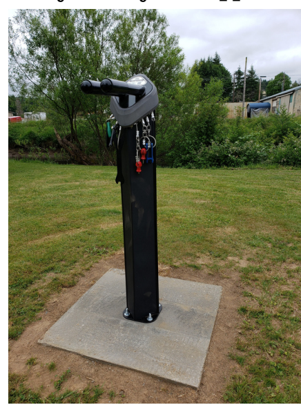
Bike repair station located in Clatskanie Park, Clatskanie, OR. Installed in 2019.